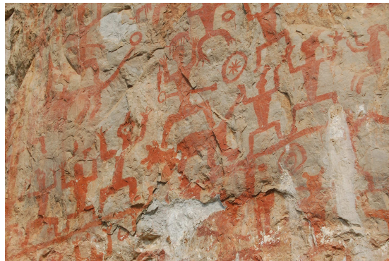
Figure 1: Part of the Huashan Pictographs displayed during the opening ceremony of Olympic Games, Beijing 2008

Huashan Pictographs are located in Ningming, Guangxi Autonomy, riverside of Ming Jiang, a Chinese National Heritage, one of few heritage of Chuang Nationality in Autonomous Region Guangxi. She is becoming very popular in the world since in the opening ceremony of Olympic Games 2008, a part of the Huashan Pictographs has been displayed to demonstrate the ancient Chinese culture (Fig. 1).