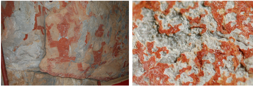
Figure 2: cracks (left) and desolving of painted limestone surface (right)

The preliminary studies show the limestone is very dense with porosity of less than 5%. The cracks are mostly caused by thermal expansion and shrinking. The urgent measurement is to fit cracked surface to make it safe.