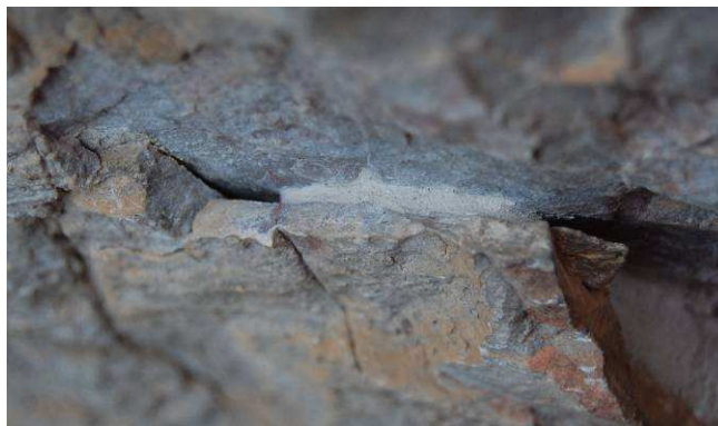
Figure 4: Pointing to hold cracked limestone